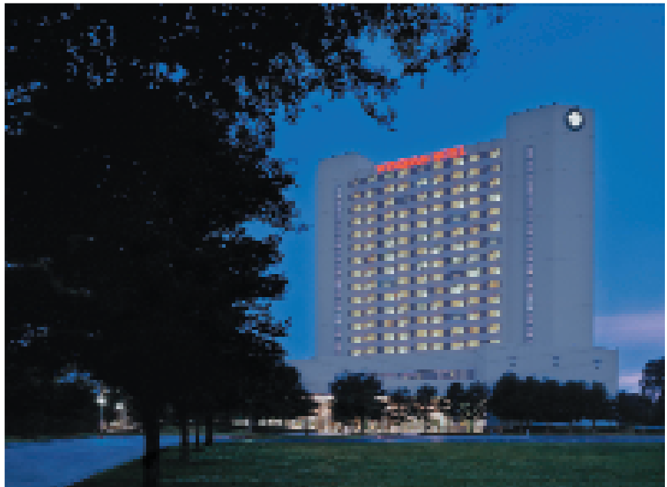
Texas Fire Protection Systems overhauled The Wyndham Arlington's primary fire safety equipment in less than 2 weeks to ensure that all rooms would be ready for the spring influx of Texas Ranger fans.