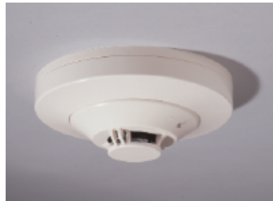
SSB224BI Isolator Base (Detector Not Included)