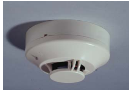
SSB501 Base Installed with Detector