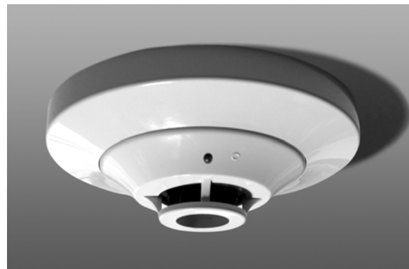
IDP-6AB Base Installed with Detector