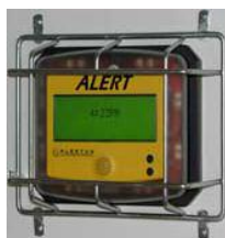
Alert Beacon Installed in an Outdoor Enclosure and an Alert Beacon Wireguard