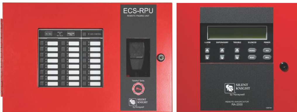
ECS-RPU shown with an RA-2000